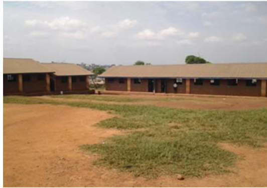
St Paul's collapsed latrine