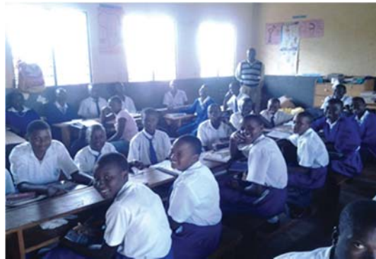
St. Paul P/S pupils in the classroom