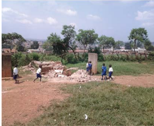
St. Paul's playground