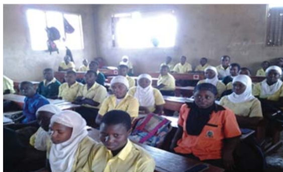
Katwe P/S pupils in the classroom