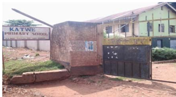
Katwe P/S classes