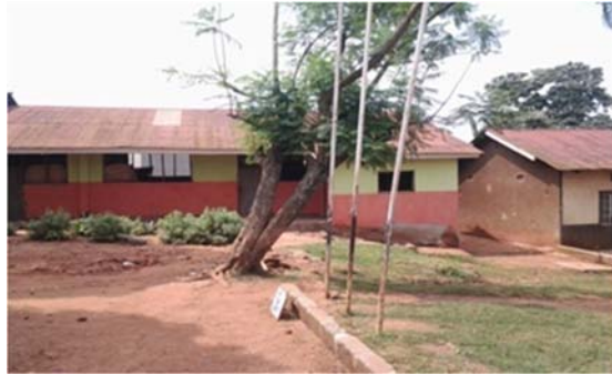
Katwe P/S entrance