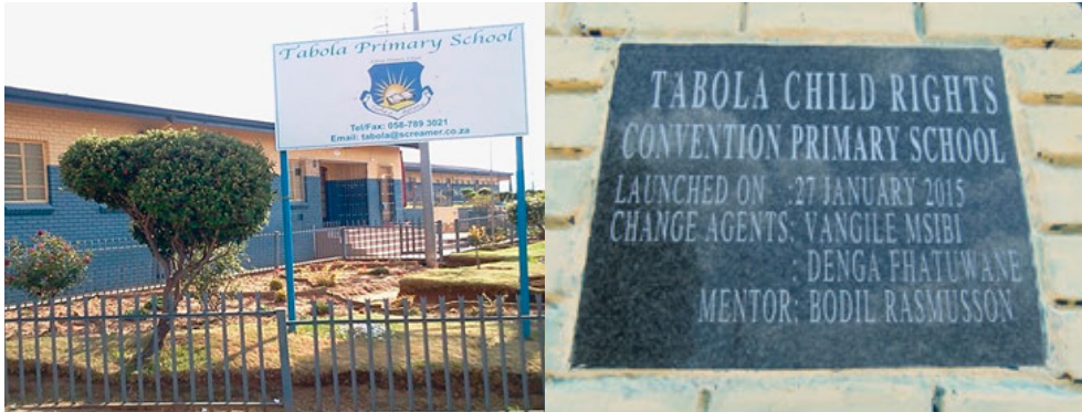
Tabola Primary School