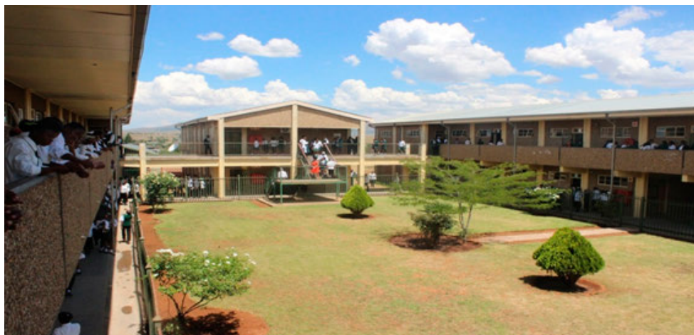
R.T Mokgopa Secondary School

Before the project, all classes were overcrowded and were difficult to control. It was difficult to monitor the activities of all learners and eliminate unwanted behavior. Acts of bullying and intimidation would go unnoticed by educators. Learners were able to be unruly with cell phones. It was also a challenge to have a one on one interaction between teachers and learners.